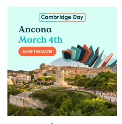
Ancona O4 March