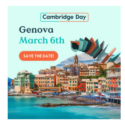
Genova O6 March