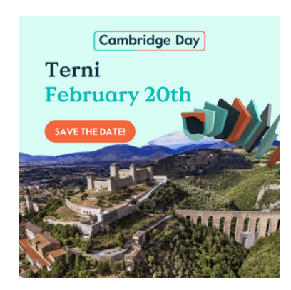
Terni 20 February