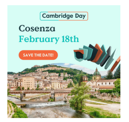
Cosenza 18 February