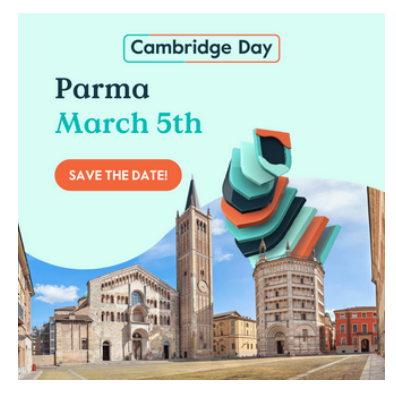
Parma 05 March