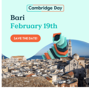
Bari 19 February